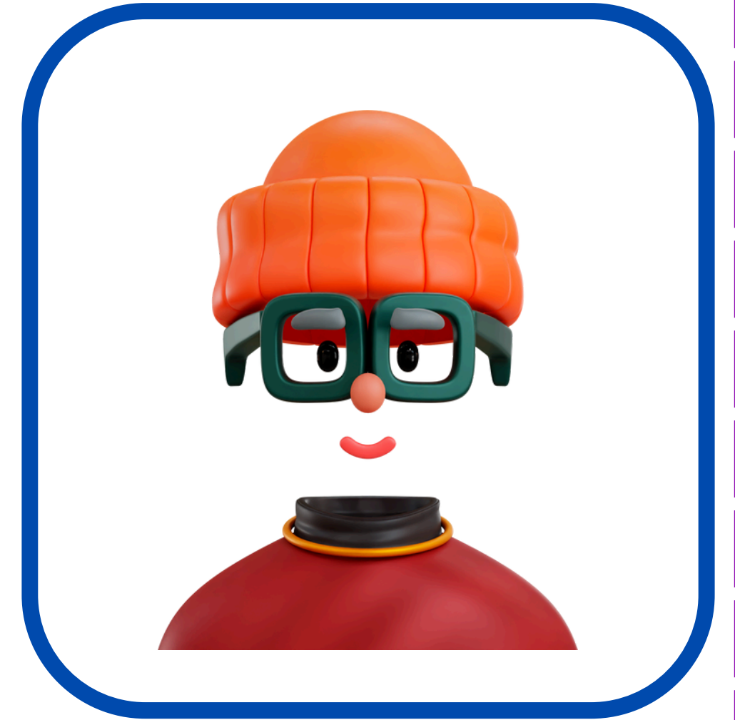
B) Be invisible