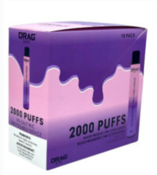
“Warning: Nicotine is highly addictive”